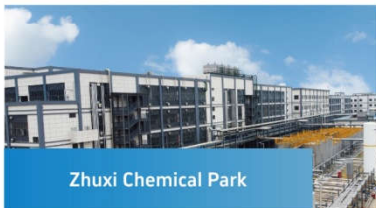
Zhuxi Chemical Park