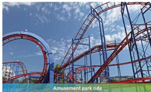
Amusement park ride