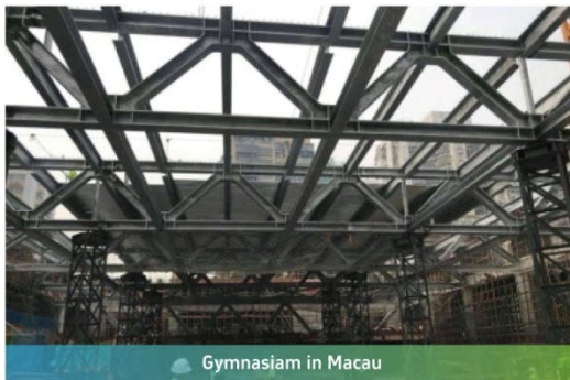
Gymnasium in Macau