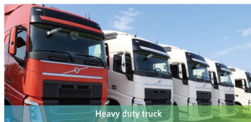
Heavy duty truck