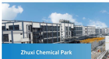
Zhuxi Chemical Park